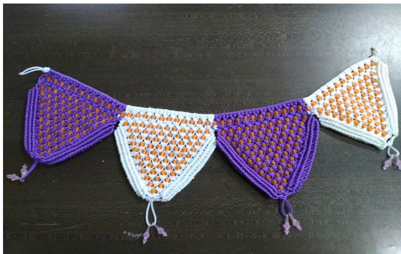
Toran prepared using Macrame thread by the students